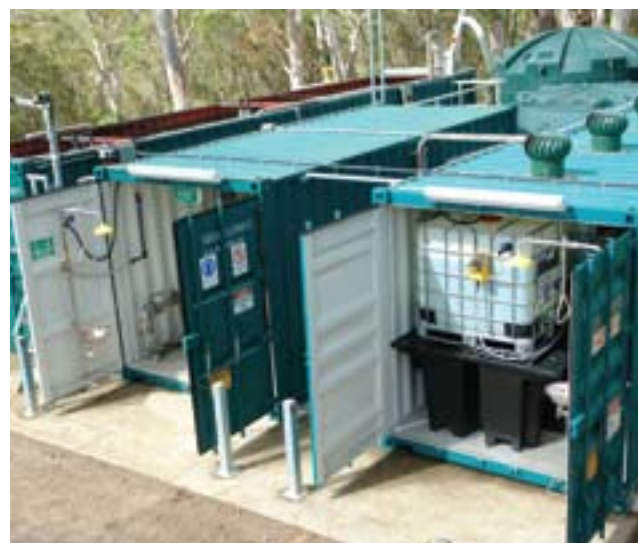
MemPAK MBR® system complete with chemical storage